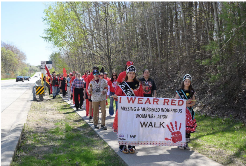
MMIR Awareness Walk 2025