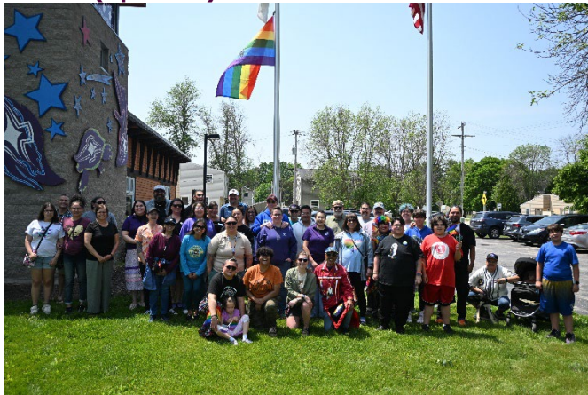
Two Spirit Pride Flag Raising