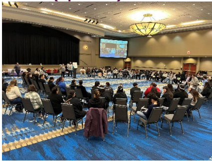
Gathering of Oneida Youth