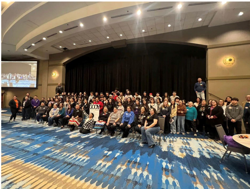
Gathering of Oneida Youth