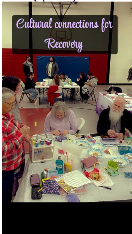
Culture recovery event