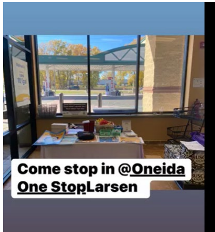
Narcan Distribution in October