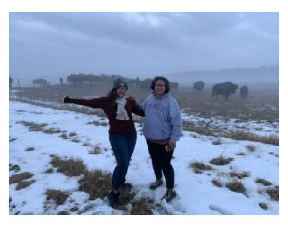
Oneida Nation Buffalo – Farm/ITBC annual grant of $32,997