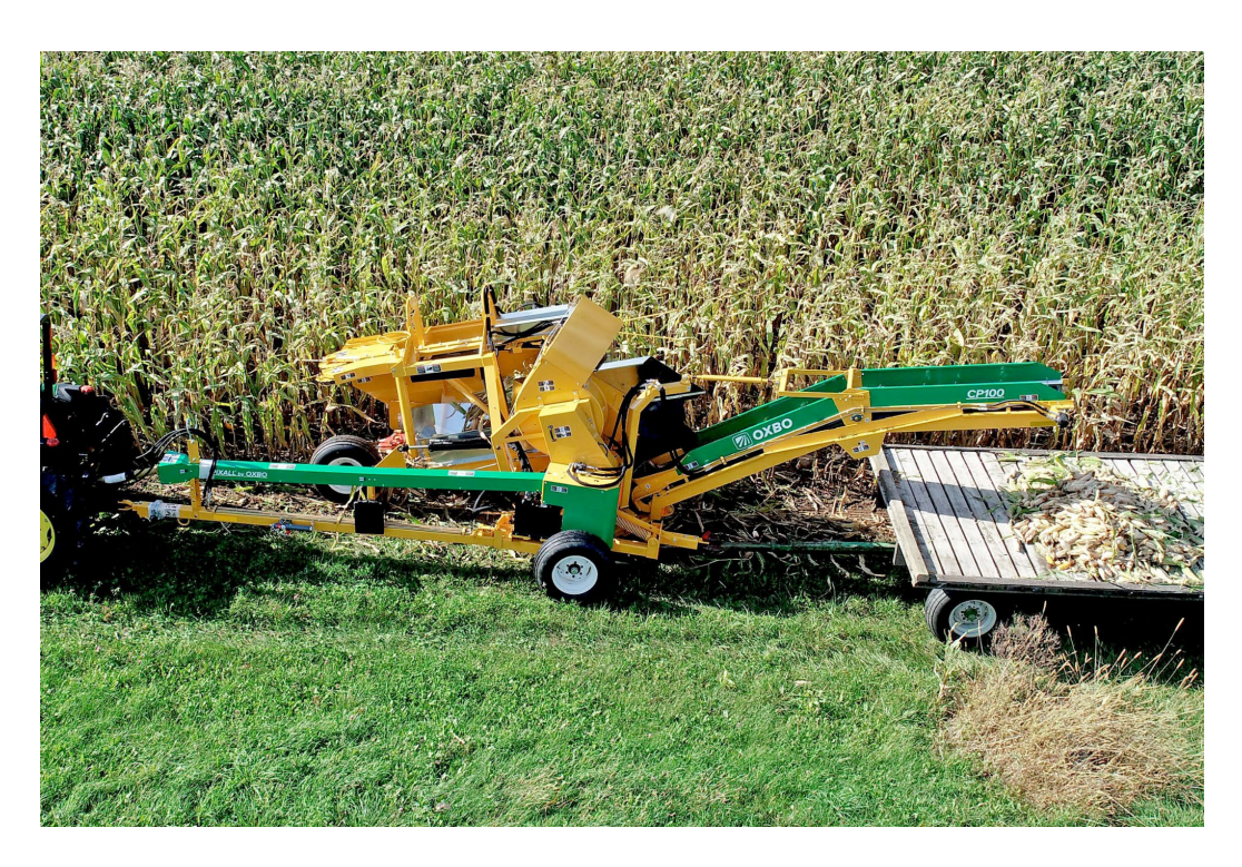
EHSLA/ OCIFS - WI Department of Agriculture Resilient Food Systems Infrastructure Program Infrastructure grant of $795,200.00. Funding will be used for equipment purchases for the Oneida Nation to process White Corn.