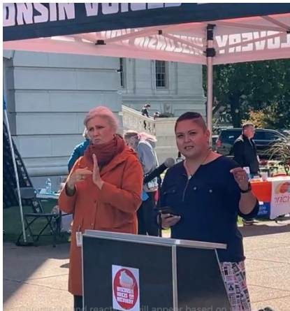
Rally for Recovery Speaker