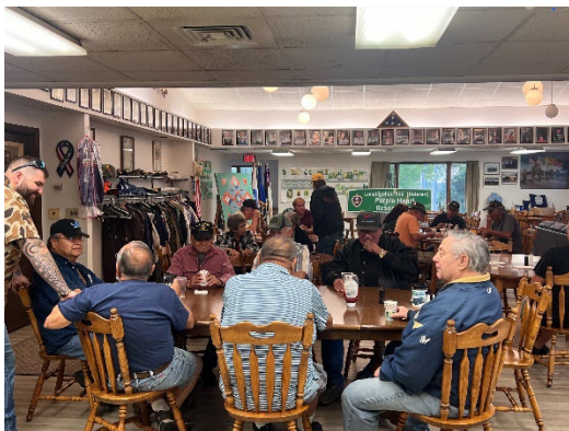
Recovery Day of Service – Breakfast for the Vets