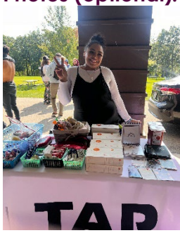
TAP at Lights of Hope Walk 2024