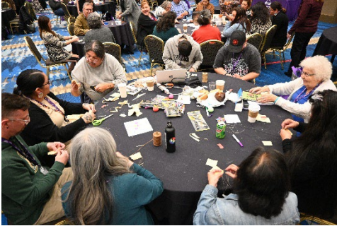
GONA February 2024