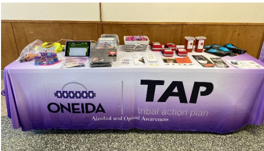
Narcan Training and Distribution at the Community Education Center