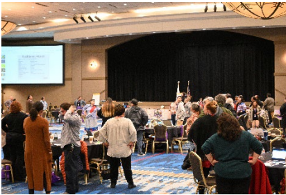
GONA February 2024