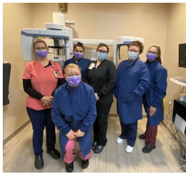
Dental Assistants and Trainees