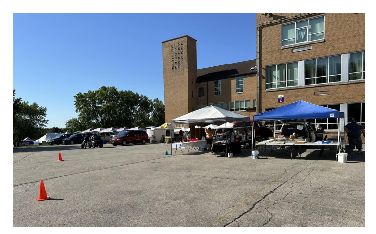
Picture 4: OFM at Oneida 200th celebration Family Fun Day in July 29, 2023