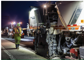
Milling & Pulverizing