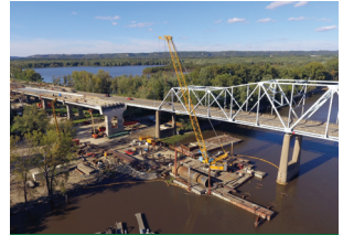
Bridges & Structures