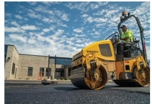
Grading & Paving