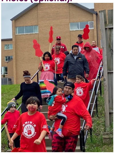
MMIW/P Walk - May 6th, 2023