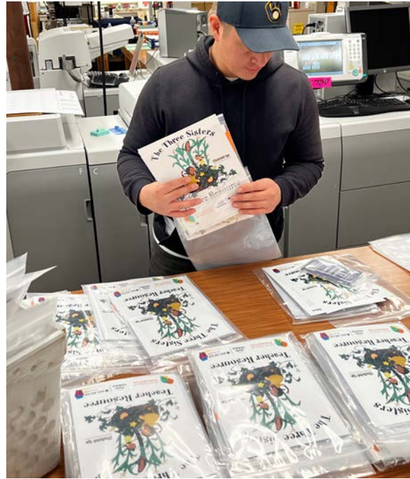
Wisconsin Humanities Grant – Big Bear Media: created 3 Sisters Cultural Resource education packets for 2 nd & 3 rd grades.