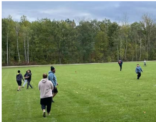
Indian Health Services TAP grant-funded event