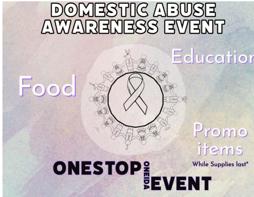
Dept. of Justice Domestic Abuse grants