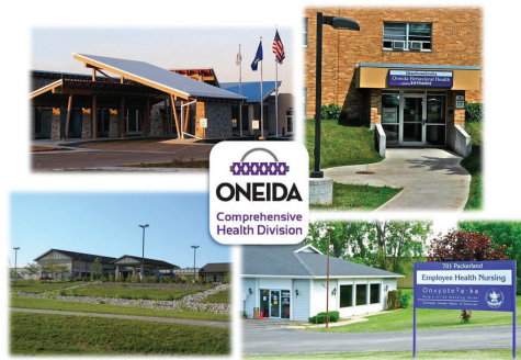
Oneida Comprehensive Health Division