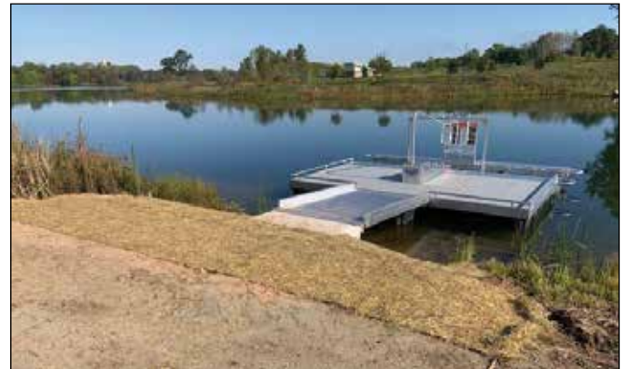
Oneida Lake Kayak launch