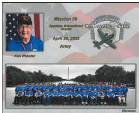
A group photo was taken of Mission 56, with the Washington Monument in the background.

The Old Glory Honor Flight began in 2009 by a dedicated group of volunteers based in Appleton, WI. Their mission is to honor local war veterans, one mission at a time. Let's all take their lead by thanking the vets in our lives for their service, one handshake at a time.