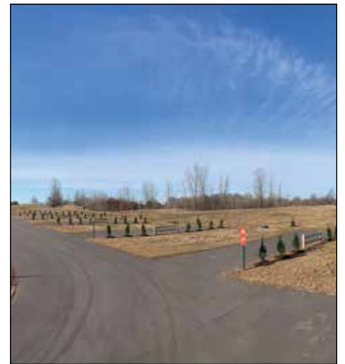
Oneida Lake Fish Camp Site

The Reopening Date is May 20th. We will hold a short event, beginning at 1:00 PM with a ribbon cutting then let you explore!