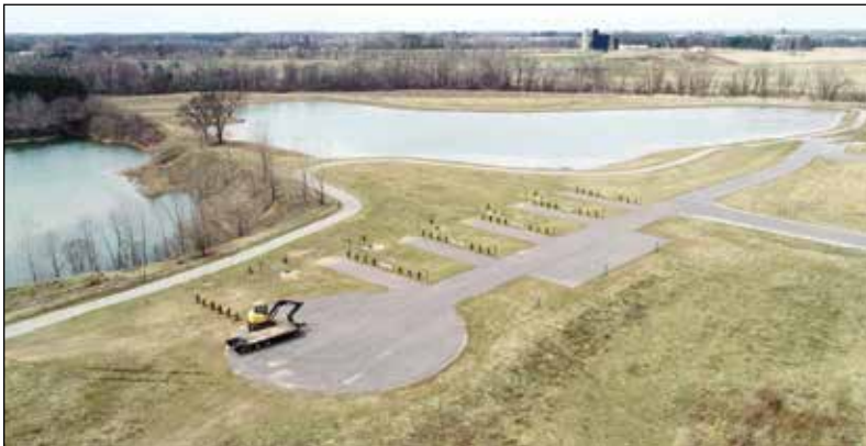
Oneida Lake looking Northeast towards Phase II