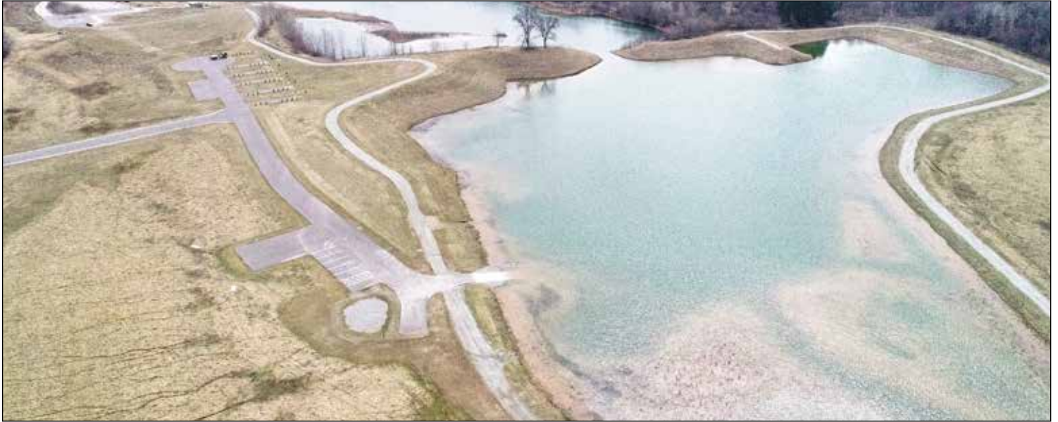
Oneida Lake looking southwest from north end