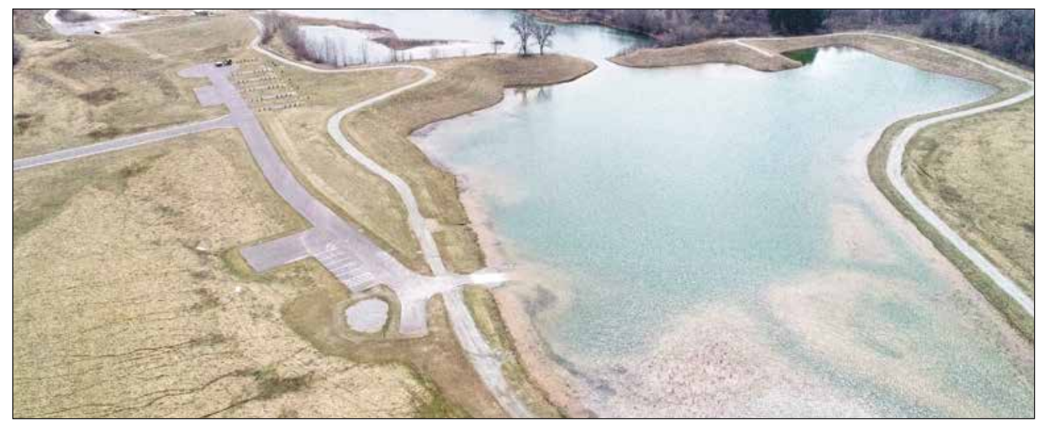
Oneida Lake looking southwest from north end