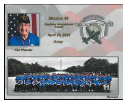
A group photo was taken of Mission 56, with the Washington Monument in the background.

The Old Glory Honor Flight began in 2009 by a dedicated group of volunteers based in Appleton, WI. Their mission is to honor local war veterans, one mission at a time. Let's all take their lead by thanking the vets in our lives for their service, one handshake at a time.