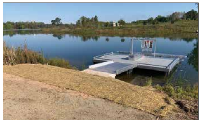
Oneida Lake Kayak launch