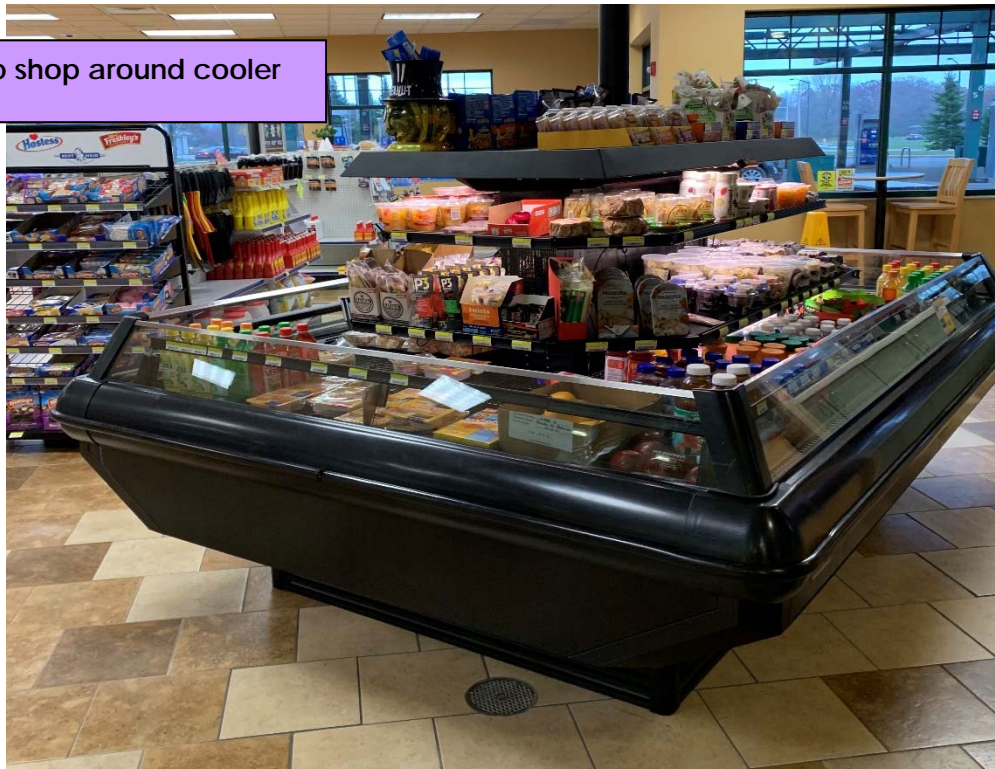
Packerland One Stop shop around cooler