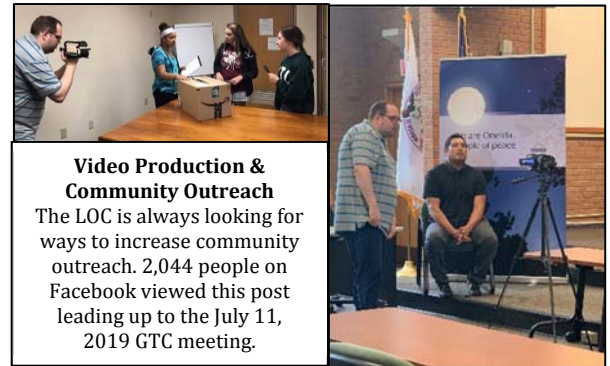
Video Production & Community Outreach The LOC is always looking for ways to increase community outreach. 2,044 people on Facebook viewed this post leading up to the July 11, 2019 GTC meeting.

the July 11, 2019 GTC meeting and take action on the Election Law Amendments. The LRO invited Oneida students from the University of Wisconsin- Information Technology Academy to participate in the video. Approximately 400 people viewed the video on Facebook in the week leading up to the GTC meeting.