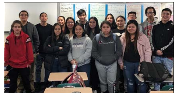
March 13, 2019 Oneida Nation High School Clan Council collaborated with the LOC on a potential Curfew Law.

The LOC is taking this opportunity to collaborate with the Oneida Nation High School (ONHS) students. On March 13, 2019 staff from the