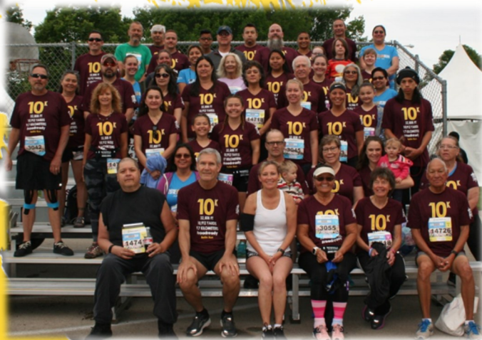
Team Oneida Picture 7:20 AM @ Astor Park

Questions? Contact Hanna at O.F.F. (920)490-3730 hleisgan@oneidanation.org