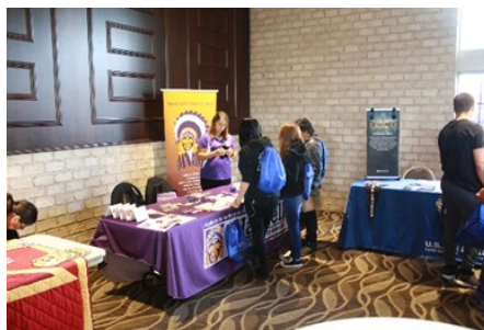
We were excited to welcome Haskell Indian Nations University and University of Notre Dame to this year's college fair.