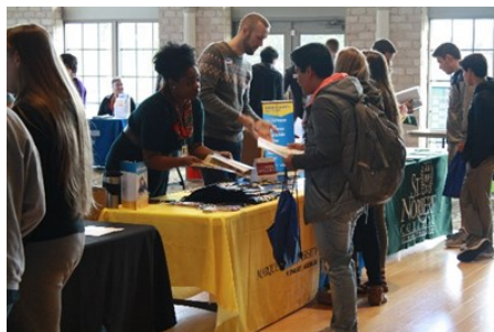
Many recruiters commented on how engaged and prepared the students were at this year's college fair.

The college selection process can be very overwhelming and the Oneida Higher Education Department is dedicated to providing services to help students navigate this process. The High School College Fair provides students with the opportunity to explore the opportunities available to them and discuss key factors important to them for the selection process. We are grateful to have the opportunity to be a part of their journey and grateful to all the volunteers who make this a successful event each year.