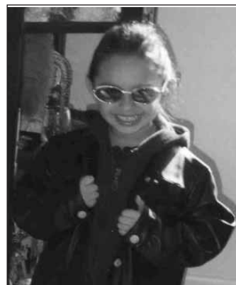
Love Mommy and Daddy