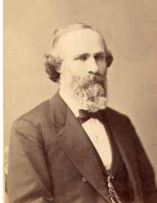
Henry Laurens Dawes

The Oneida Boarding School main buildings were built very nicely of brick. The school was basically self-contained and included a farm and hospital.