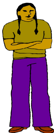
Lak s íha