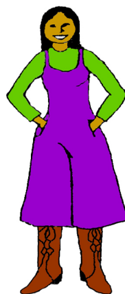
Ak s íha