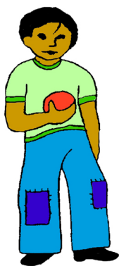
I?k á ha