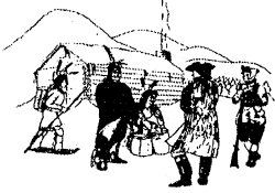
Oneidas bringing several hundred bags of corn to Washington's starving army, at Valley Forge, after the colonists had consistently refused to aid them.