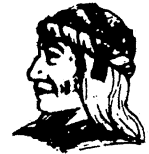
UGWA DEMOLUM YATEHE Because of the help of this Oneida Chief in cementing a friendship between the six nations and the colony of Pennsylvania, a new nation, the United States was made possible.