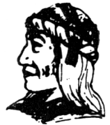
UGWA DEMOLLUM YATEHE Because of the help of this Oneida Chief in cementing a friendship between the six nations and the Colony of Pennsylvania, a new nation, the United States, was made possible.