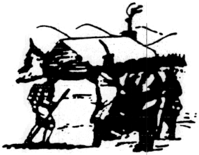
Oneidas bringing several hundred bags of corn to Washington's starving army at Valley Forge, after the colonists had consistently refused to aid them.