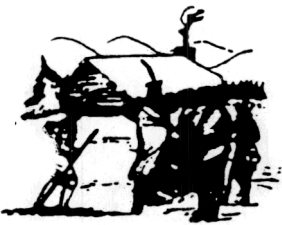
Oneidas bringing several hundred bags of corn to Washington's starving army at Valley Forge, after the colonists had consistently refused to aid them.