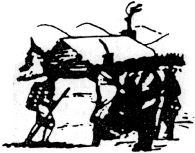
Oneidas bringing several hundred bags of corn to Washington's starving army at Valley Forge. after the colonists had consistently refused to aid them