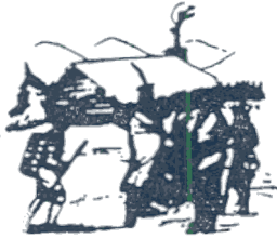
Oneidas bringing several hundred bags of corn to Washington's starving army at Valley Forge, after the colonists had consistently