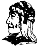
UGWA DEMOLUM YATEHE Because of the help of this Oneida Chief in cementing a friendship between the six nations and the Colony of Pennsylvania, a new nation, the United States, was made possible