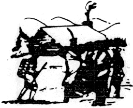
Oneidas bringing several hundred bags of corn to Washington's starving army at Valley Forge after the colonists had consistently refused to aid them