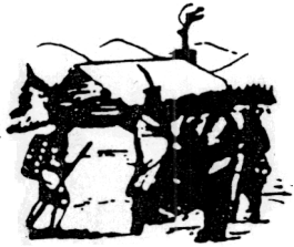
Oneidas bringing several hundred bags of corn to Washington's starving army at Valley Forge, after the colonists had consistently