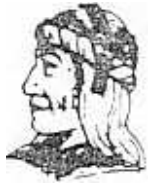
UGWA DEMOLUM YATEHE Because of the help of this Oneida Chief in cementing a friendship between the six nations and the Colony of Pennsylvania, a new nation the United States was made possible