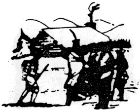
Oneidas bringing several hundred bags of corn to Washington's starving army at Valley Forge. after the colonists had consistently refused to aid them