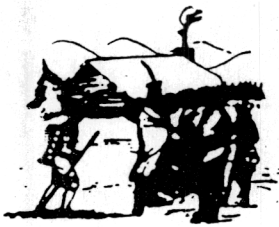
Oneidas bringing several hundred bags of corn to Washington's starving army at Valley Forge, after the colonists had consistently