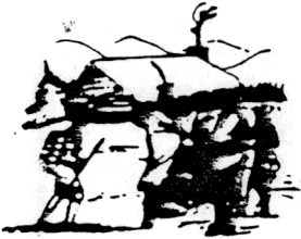
Oneidas bringing several hundred bags of corn to Washington's starving army at Valley Forge after the colonists had consistently