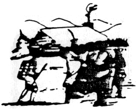
Oneidas bringing several hundred bags of corn to Washington's starving army at Valley Forge after the colonists had consistently refused to aid them