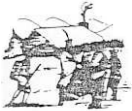
Oneidas bringing several hundred bags of corn to Washington's starving army at Valley Forge after the colonists had consistently refused to aid them