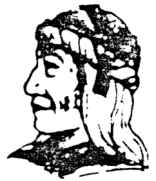
UGWA DEMOLUM YATE-HE Because of the help of this Oneida Chief in cementing a friendship between the six nations and the Colony of Pennsylvania a new nation the United States was made possible