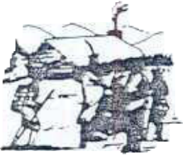
Oneidas bringing several hundred bags of corn to Washington's starving army at Valley Forge after the colonists had consistently refused to aid them.