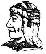
UGWA DEMOLUM YATEHI Because of the help of the Oneida Chief in cementing a friendship between the six nations and the Crown of Pennsylvania a new nation for the United States was made possible.