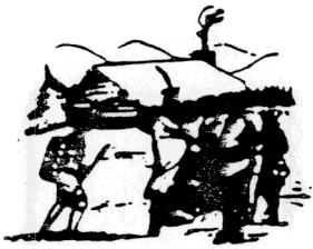
Oneidas bringing several hundred bags of corn to Washington's starving army at Valley Forge after the colonists had consistently