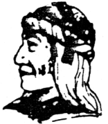
UGWA DEMOLUM YATEHE Because of the help of this Oneida Chief in cementing a friendship between the six nations and the Colony of Pennsylvania, a new nation the United States was