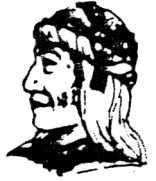
UGWA DEMOLUM YATEHE Because of the help of this Oneida Chief in cementing a friendship between the six nations and the Colony of Pennsylvania, a new nation: the United States was made possible.