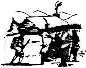
Oneidas bringing several hundred bags of corn to Washington's starving army at Valley Forge after the colonists had consistently