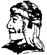
UGWA DEMOLUM YATEHE Because of the help of this Oneida Chief in cementing a friendship between the six nations and the Colon of Pennsylvania, a new nation the United States was made possible