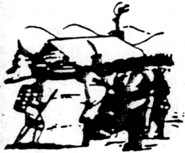
Oneidas bringing several hundred bags of corn to Washington's starving army at Valley Forge after the colonists had consistently refused to aid them