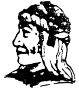
UGWA DEMOLUM YATEHE Because of the help of this Oneida Chief in cementing a friendship between the six nations and the Colony of Pennsylvania, a new nation the United States was made possible