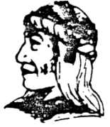
UGWA DEMOLUM YATEHE Because of the help of this Oneida Chief in cementing a friendship between the six nations and the Colony of Pennsylvania, a new nation, the United States, was