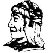
UGWA DEMOLUM KATEHI Because of the help of the Oneida Chief in cementing a friendship between the Senecas and the Oneidas of Pennsylvania, a new nation for the United States was made possible.