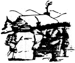
Oneidas bringing several hundred bags of corn to Washington's store in 1784.