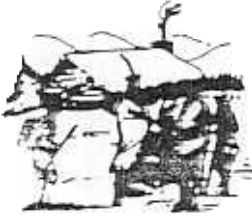
Oneidas, bringing several hundred bags of corn to Washington's starving army at Valley Forge after the colonists had consistently refused to aid them.