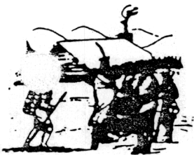
Oneidas bringing several hundred bags of corn to Washington's starving army at Valley Forge, after the