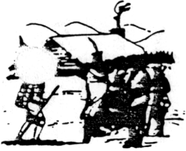
Oneidas bringing several hundred bags of corn to Washington's starving army at Valley Forge, after the colonists had consistently