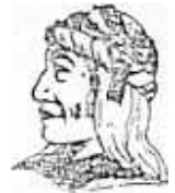
UGWA DEMOLUN YATENE

Because of the help of this Oneida Chief in cementing a friendship between the six nations and the Colony of Pennsylvania, a new nation, the United States was made possible.