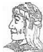
USGWA DEHOLUN YATENE

Because of the help of this Oneida Chief in cementing a friendship between the six nations and the Colony of Pennsylvania, a new nation, the United States was made possible.